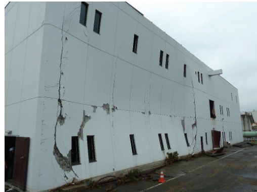
Figure 12. Out-of-plane fracture of RC shear wall