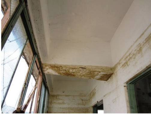
Figure 6. Tsunami traces