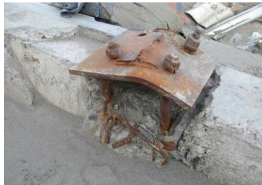
Figure 16. A building washed out due to the fracture of anchor bolts and/or base plates