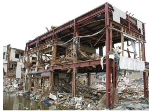
Figure 22. Residual 2-story steel building