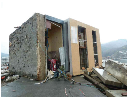
Figure 4. Overturned building with mat foundation

Most of overturned buildings were moved from their original positions. It is estimated that large buoyancy acted on the buildings. The overturned four-story building moved 70 m from its original positions without dragged traces on the ground. One of the buildings climbed over a concrete block fence on an adjoining land (about 2 m) without destroying the fence (Figure 7). The building seems to have floated up by buoyancy.