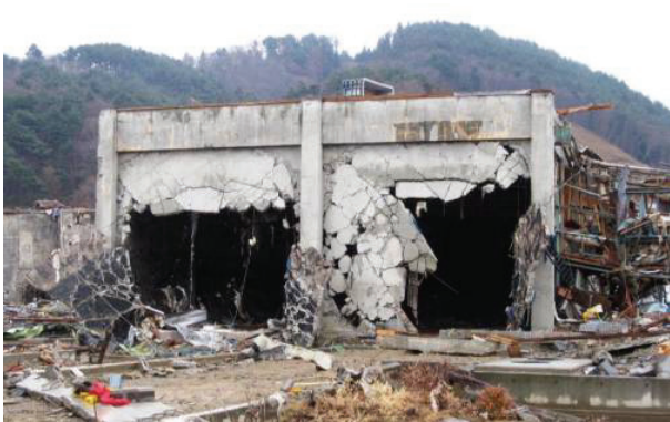
Figure 11. Fracture of non-structural RC walls

In one case of a damaged building (Figure 12), a 300 mm-thick shear wall with double layer bar arrangement and a support span of more than 10 m and without no 2-story floor was bent inside by a tsunami wave pressure. However, a shear wall in an area (Figure 12, Back of the building), where there is a floor on the second story and a support span is not long in the same building, was not bent. A tsunami wave force that acts on a building will be reduced if the building's opening becomes larger. However, a size of outlet openings should be also taken into consideration in order to flow out of the building in design.