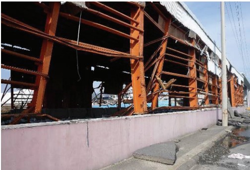
Figure 23. Local deformation of columns