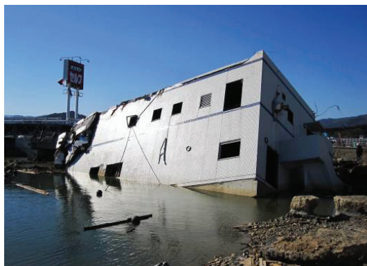
Figure 10. Sliding of two-story building with scoured spread foundation