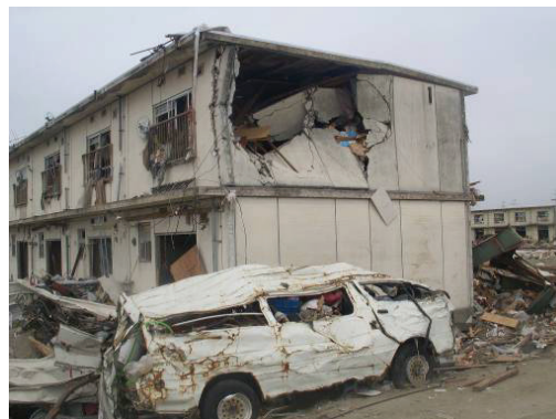
Figure 14. Precast concrete wall opening generated by debris impact