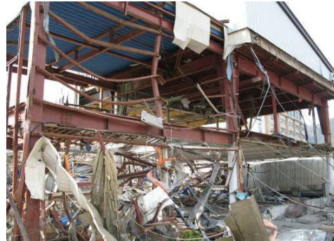
Figure 24. Local deformation of nonstructural elements