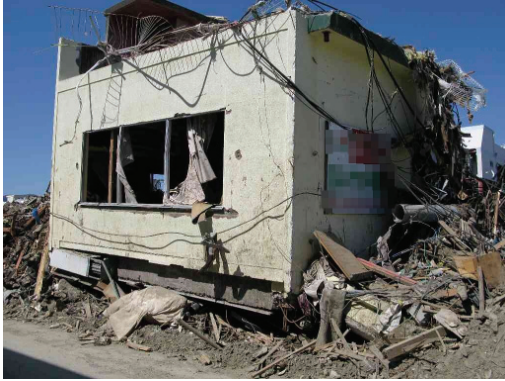
Figure 2. 1 st story collapse of a two-story building