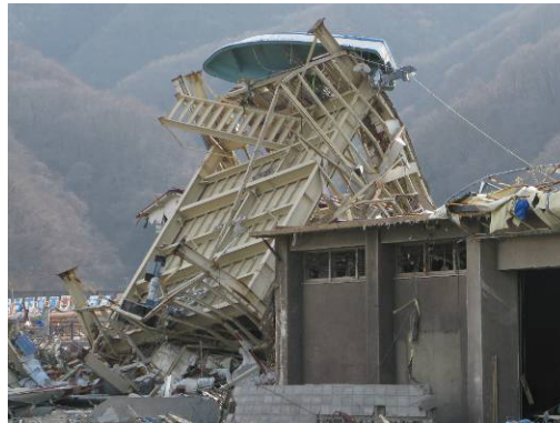
Figure 15. Steel building overturned by fracture of column base anchor bolts