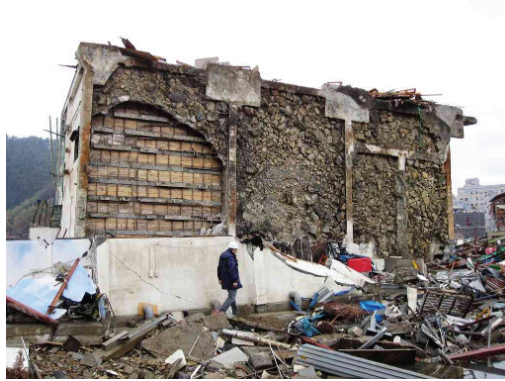
Figure 7. Building climbed over a concrete block fence