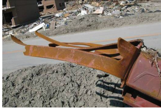
Figure 17. 1 st -story columns falling in the same direction Figure 18. Fracture of the flanges of beams