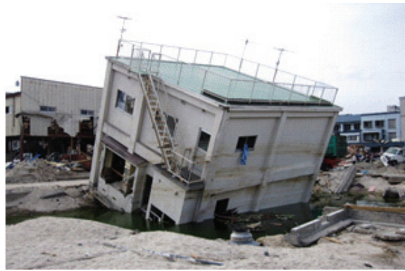
Figure 9. Two-story building tilted by scouring