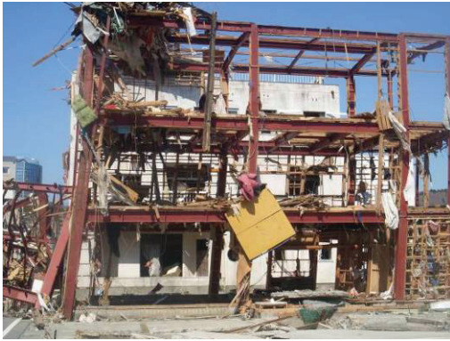
Figure 21. Residual deformation in 3-story steel building