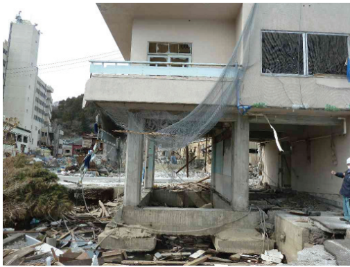
Figure 8. Large holes on the ground by scouring