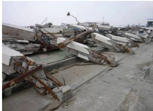
Figure 1. Pancake collapse of a two-story building