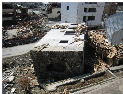
Figure 5. Overturned building with pile foundation