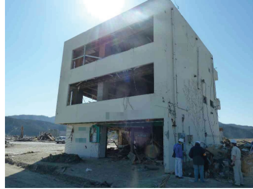
Figure 3. Survived three-story building