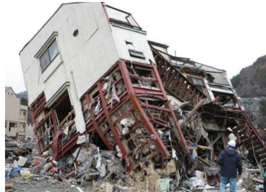
Figure 19. Overturned four story steel building