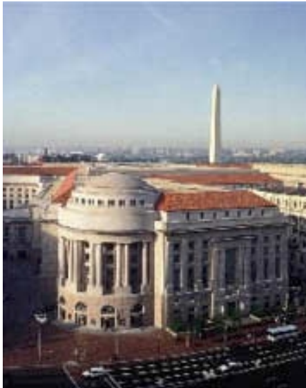
1300 Pennsylvania Avenue Washington, DC

In November 1999, the Applied Technology Council (ATC) opened an East Coast office in Washington, DC. The new office, located in the recently completed International