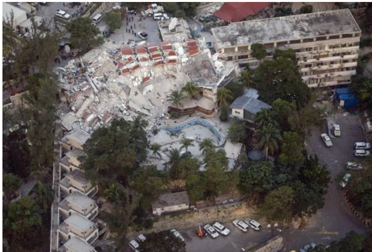
Figure 1. Collapsed UN building (UNDP Global 2010)

2010 Haiti Earthquake. The catastrophic 2010 Haiti earthquake has had a tragic effect on the lives of more than 3 million people, including over 200,000 casualties, over 1,000,000 displaced people, and financial losses that crippled the country's economy. Thousands of buildings collapse, including the United Nations (U.N) headquarters Port-au-Prince; as shown in Figure 1.