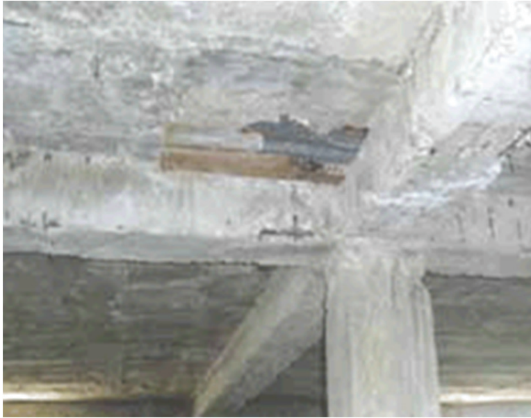
Figure 2. Example of poor construction in Haiti

2011 New Zealand Earthquake. The magnitude-6.3 February 2011, New Zealand, earthquake caused more than 160 deaths and damage costing over US$20 billion. Many buildings were damaged; over 30% of the brick and stone buildings in the central business district (CBD) either collapsed or sustained major damage (see Figure 3) resulting in total closure of the CBD for period of several months because many of the remaining buildings were considered unsafe (Miyamoto International 2011).