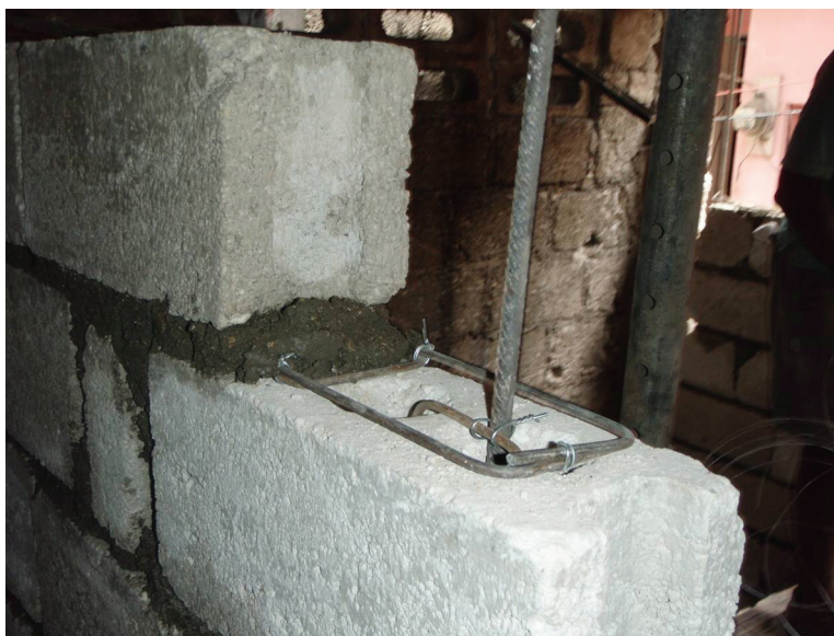
Figure 5. Example of acceptable reconstruction in Haiti

The seismic rehabilitation of thousands of buildings that is currently under way (see Figure 5) will allow many more thousands to return home, and provide a safe and seismically resilient community for citizens. At the time of this paper, over 9,000 houses have been reconstructed under various programs; see Table 2.