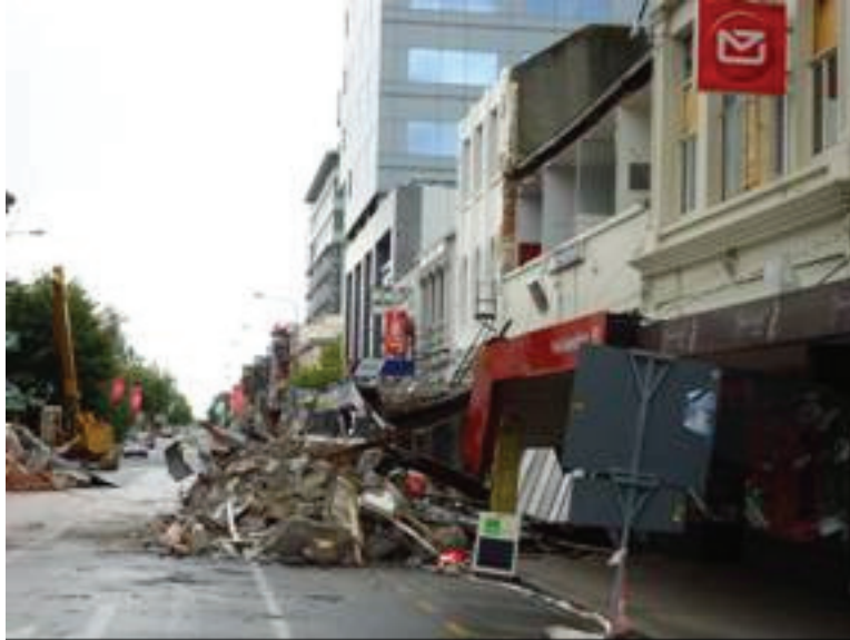
Figure 3. Collapsed masonry buildings in the CBD

2011 New Zealand Earthquake. The magnitude-6.3 February 2011, New Zealand, earthquake caused more than 160 deaths and damage costing over US$20 billion. Many buildings were damaged; over 30% of the brick and stone buildings in the central business district (CBD) either collapsed or sustained major damage (see Figure 3) resulting in total closure of the CBD for period of several months because many of the remaining buildings were considered unsafe (Miyamoto International 2011).