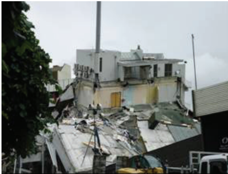
Figure 4. Collapsed nonductile concrete building in the CBD

September 2010 earthquake (which had no direct fatalities). The 2011 Earthquake caused extensive liquefaction and ground failure, which also led to widespread loss of water and electricity. The severity of this earthquake was unexpected in Christchurch and points to the same problem that exists in many other urban areas that are close to active faults. The level of damage to modern (post-1980) construction was alarming. Over 50% of the building stock—more than 1,300 buildings—are expected to be claimed as total losses. Many of these buildings were designed and constructed using modern seismic codes. Nonetheless, they sustained significant structural and nonstructural damage, and many have to be demolished. Similar observations were made following the 2010 Chile earthquake. In both countries, modern seismic codes are advanced and local engineers are quite capable, and there are tight construction standards. It is important to note that the building codes likely did what they were intended to do: that is, to provide life safety and prevent collapse. However, the codes do not have provisions for either the building condition after an earthquake or financial losses as a result of an earthquake.