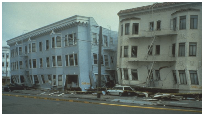
Figure 3. Two multi-unit, wood-frame buildings that collapsed in the Marina District of San Francisco during the 1989 Loma Prieta earthquake.

In calling for this work, the Mayor recognized that an effective program for the seismic evaluation and retrofit of vulnerable multi-unit, soft-story wood-frame residential buildings would enable San Francisco to retain significant amounts of housing after a major damaging earthquake, preserve architectural and cultural attributes, conserve energy and resources, and improve public safety.